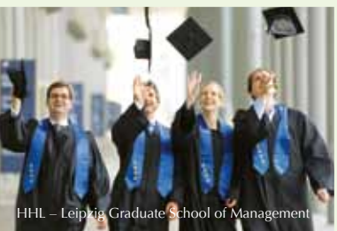
HHL – Leipzig Graduate School of Management