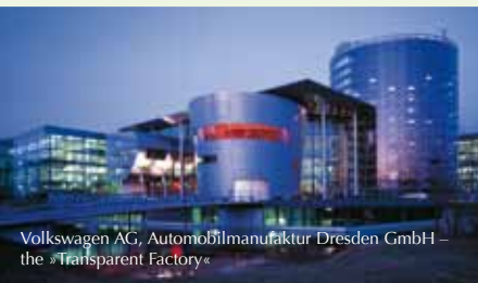
Volkswagen AG, Automobilmanufaktur Dresden GmbH – the »Transparent Factory«