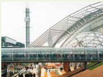
Leipziger Messe GmbH