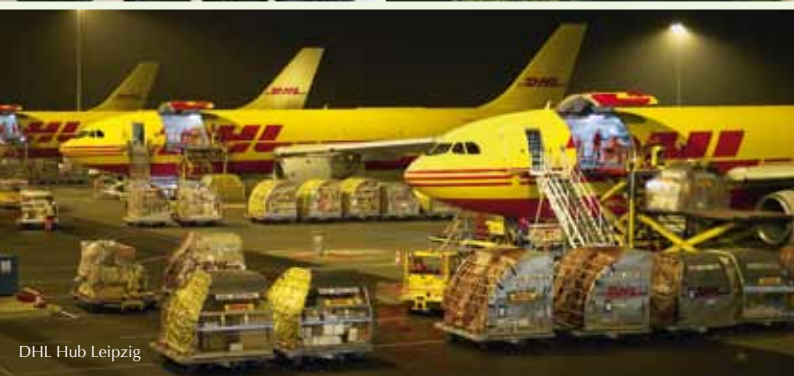
DHL Hub Leipzig