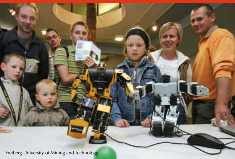
Freiberg University of Mining and Technology